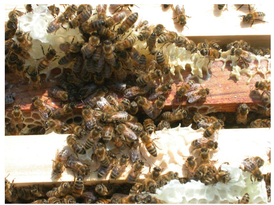
Figure 2, Clean any burr comb from the top bars of frames or other hive equipment.

Be especially careful when cleaning the internal corners of the boxes and the frame runners, as these provide ideal nooks and crannies that may harbour pests and pathogens. You may wish to consider removing "dirty" frame runners altogether and replacing them with new ones when you reassemble the disinfected hive. If you plan to sterilise your equipment by scorching (see below), remember to remove all plastic runners. During the process of scraping, bits of wax and propolis will fall onto your cardboard or newspaper sheets, and all this should subsequently be destroyed by burning when you have completed this part of the cleaning process. You will also need to clean your scraper before you put it away.