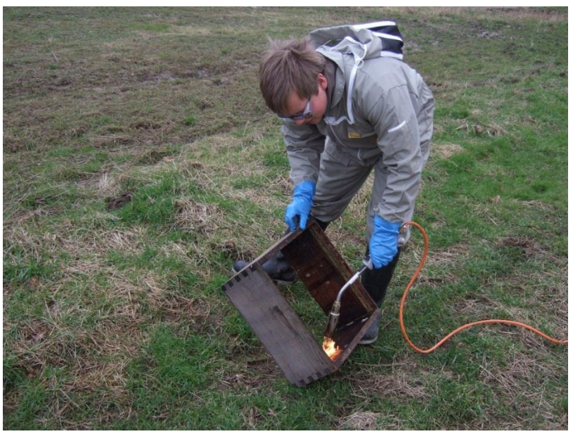
Figure 3, Scorching a brood box with a blow lamp.