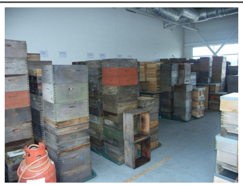
Figure 1, clean apiary storage

Honey bee colonies are subject to infection or infestation by a range of pests and diseases. These include insects, mites, fungi, viruses, and bacteria, such as the microbes that cause American or European foulbrood (AFB and EFB) ( Paenibacillus larvae and Melissococcus plutonius ). Honey bees are social insects and are at risk of epidemics, so it is essential that beekeepers not only recognise the signs of such pests and diseases, but also know how to reduce their impact in colonies, apiaries and the locality. A key factor in preventing the spread of infection is good hygiene. The following Fact Sheet provides some advice about when and how you should be cleaning your hives and your equipment.