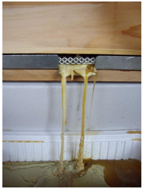
Figure 7, hot wax collecting from a steam wax extractor.

Begin by placing a box filled with dirty frames onto the purpose built collection tray, which needs to be similar in size and shape to a hive floor but with a small opening at one edge and cover with the lid. Attach the end of the hose pipe from the steam chamber into the top of the sealed box (Figure 6). As the wax softens and melts it runs down through the box and out of the opening in the tray, from where it can be collected for use in wax exchange (Figure 7). The stripped and cleaned wooden frames can be reused. Allow at least one hour of treatment for each box of frames. When the steam cleaning process is complete, you can sterilise frames using washing soda treatment (see the 'Sterilisation using washing soda crystals' section of this leaflet), before refitting with fresh foundation.