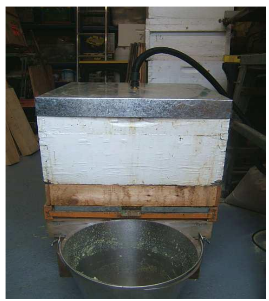
Figure 6, a fully assembled steam cleaning apparatus