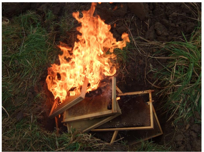
Figure 9, burning diseased combs and frames.