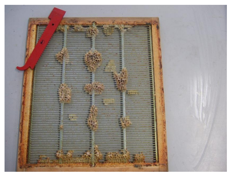
Figure 8, remove any burr comb or debris by scraping it off. Ensure you clean the hive tool afterwards.

Queen excluders need to be cleaned and sterilised in different ways, depending on the type used. Begin by removing debris by scraping with a suitable tool (Figure 8). It is easier to remove propolis when it is cold and wintery, as propolis will be brittle under these conditions. A wire brush is very useful to remove bits of wax and propolis. Wire excluders can then be scorched using a blowlamp, but if they are soldered be careful not to melt the solder joints as sometimes they are very 'soft'. If foulbrood has been present, zinc slotted excluders must be destroyed by burning. Otherwise, it is possible to scrub these clean with a solution of washing soda. This needs to be fairly concentrated (1 kilogram of soda to 5 litres of water), and a dash of washing up liquid in the mix also helps. You will need to wear suitable protective clothing, protect your eyes and use rubber gloves . Plastic excluders can be disinfected in the same way as plastic hives and components, as described above.